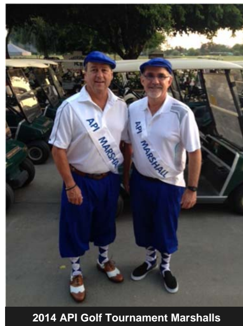
2014 API Golf Tournament Marshalls